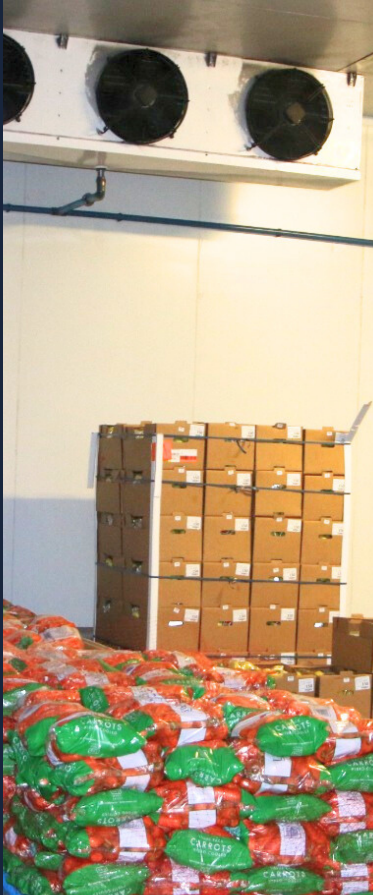
24/7 Cold Storage