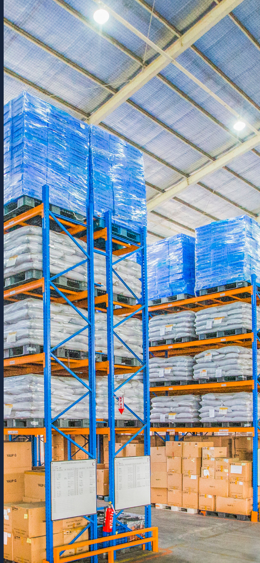
Ambient Product Staging