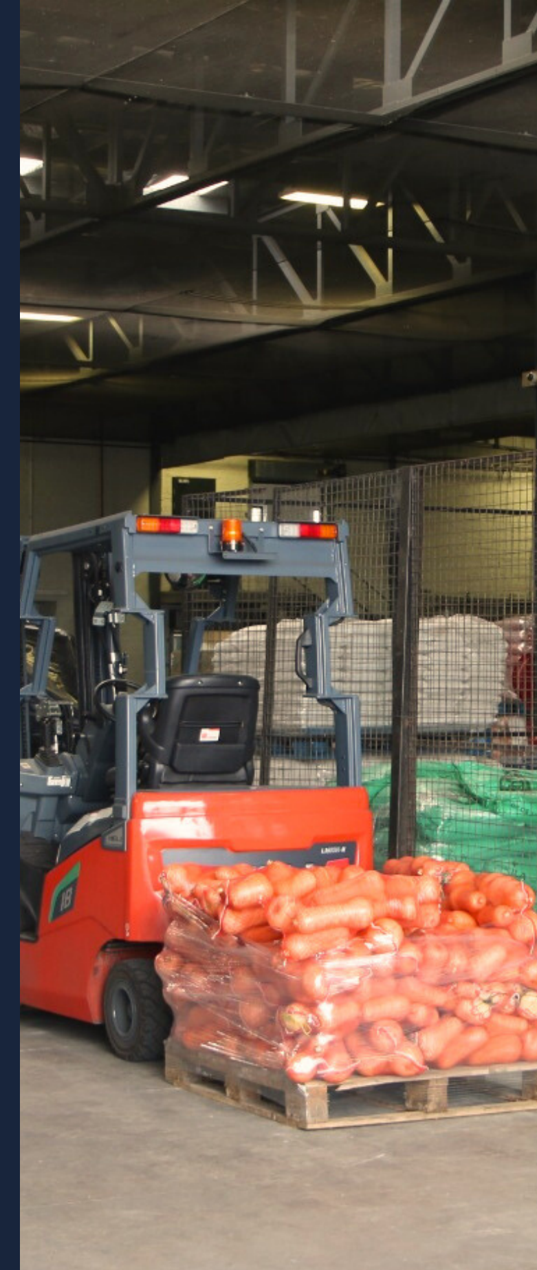
Product Handling and Delivery